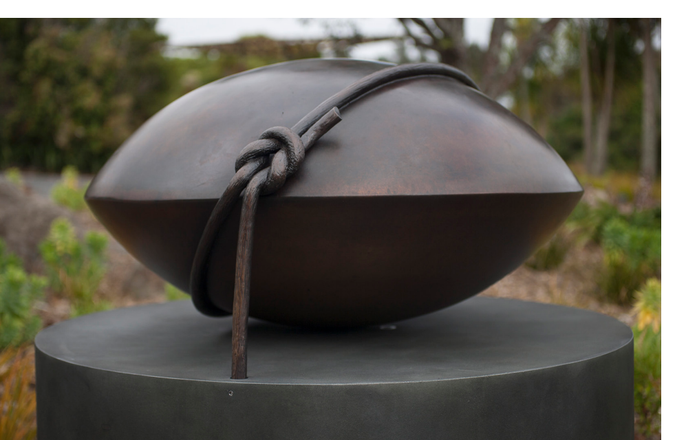
Art - Gardens - Connection - Learning

20 November 2021 – 6 March 2022 AUCKLAND BOTANIC GARDENS